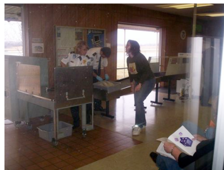
Passenger Security Inspection