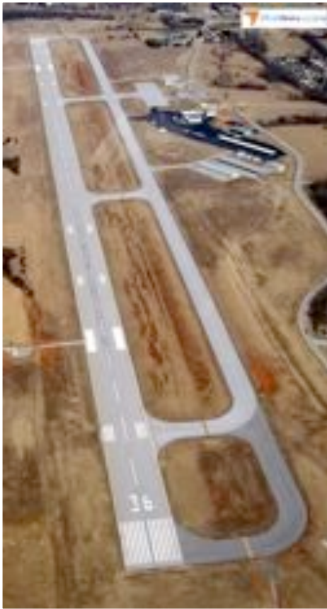
Overhead View of Runway

runway ends are served by multiple non precision approaches.