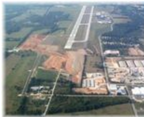
Pilot's view of Final Approach to Runway 36